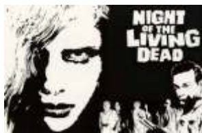
Night of the Living Dead October 2015