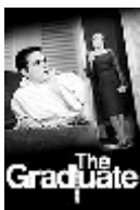
The Graduate September 2015