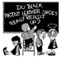
Do Black Patent Leather Shoes Really Reflect Up? August 2015