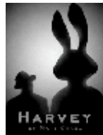
Harvey July 2015