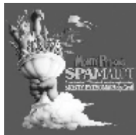
Spamalot June 2015