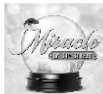
Miracle on 34th Street December 2015