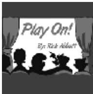
Play On! May 2015

Season tickets are a wonderful gift for that theater enthusiast in your life or for the person who has everything already. Don't miss a minute of DeKalb County's greatest community theater.