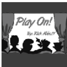
Play On! May 2015

Season Tickets are a great Christmas gift. Ask the Box Office Staff for an order form and get started on the Stage Coach Players 2015 Season!