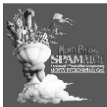
Spamalot June 2015