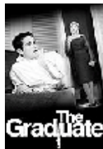
The Graduate September 2015