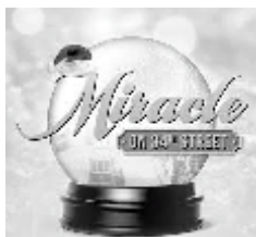
Miracle on 34th Street December 2015