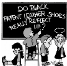
Do Black Patent Leather Shoes Really Reflect Up? August 2015