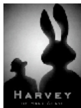
Harvey July 2015