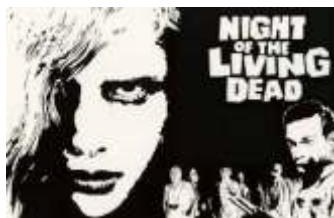
Night of the Living Dead October 2015